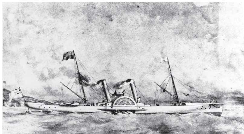
Figure 3. CS blockade-runner Lynx (1864) black-and-white photo of watercolor painting, unknown artist.

The Lynx , a beautiful sidewheel steamer built by Jones, Quiggin & Co. in Liverpool, England, was nicknamed "glamour girl of the sea." A black and white photo of a water-