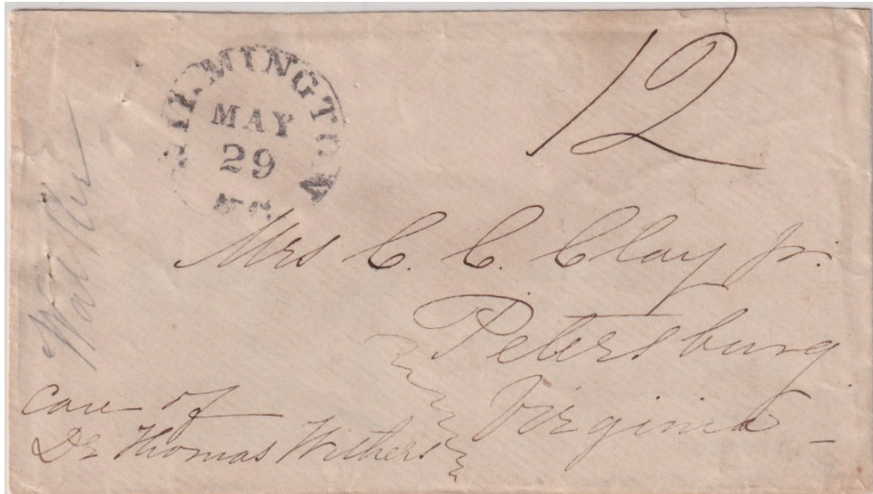
Figure 1. A second genuine blockade-run cover forwarded from Confederate agent Norman Walker, Confederate agent in Bermuda.

The only recorded use of the “Forwarded by N.S. Walker St. Georges Bermuda” handstamp is on a blockade-run cover. It shows the proper 12¢ rate, and it bears the ship routing “Per Flora” into the port of Wilmington, N.C. This use clearly demonstrates Maj. Norman S. Walker indeed acted as mail forwarder. To date, there are no other recorded examples.