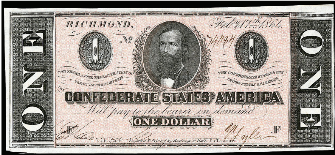
Figure 5. A 1864 $1 Confederate note (T71) printed by Keatinge & Ball, that features the portrait of C.C. Clay, Jr.