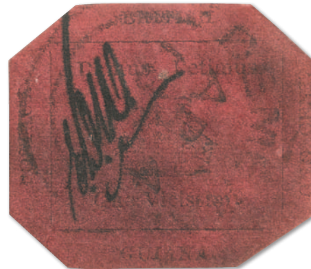
The front of the British Guiana 1¢ Magenta stamp.