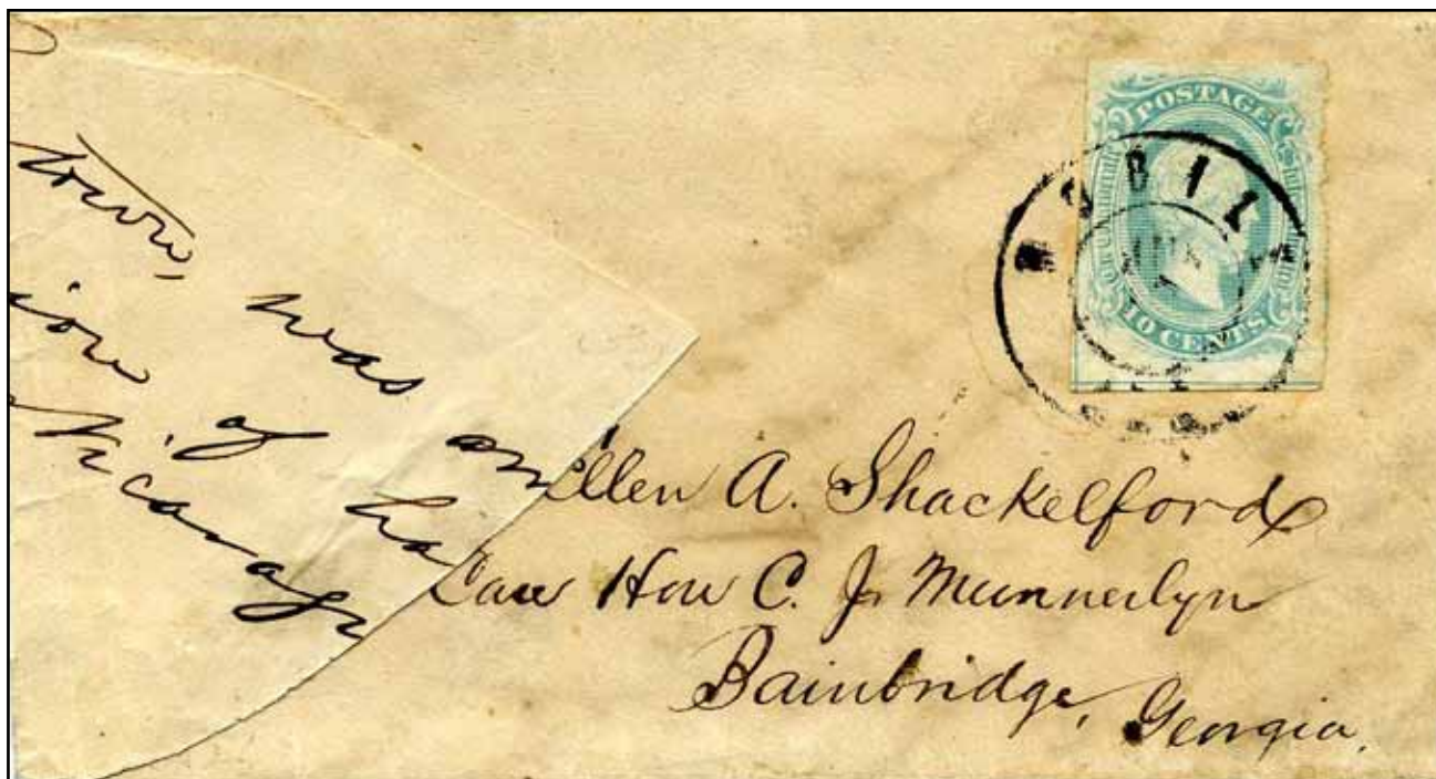
Figure 1. A Confederate 10-cent blue frame line tied by Mobile, Ala. double circle postmark on cover fashioned from prewar letter, addressed to: 'Miss Ellen A. Shackelford, Care Hon. C.J. Munnerlyn, Bainbridge, Georgia.' The stamp has a full frame at the bottom, a partial at the lower left and a trace at right. Full four-frame frame-line stamps are quite rare as the frame lines were shared by adjacent stamps.