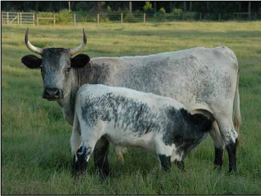
Figure 3. A Florida Cracker cow and calf.