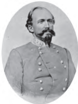
General John Hunt Morgan