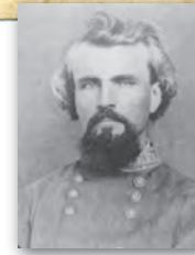
CSA General Nathan Bedford Forrest shown early in the war (at left) and near the end.

panies at his own expense, of which he was elected Lieutenant Colonel.