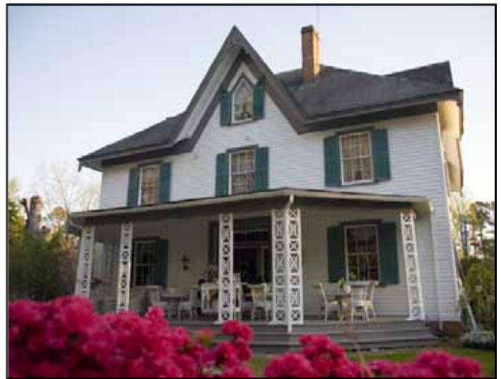
Figure 5: Edgewood as it appears today as a Bed and Breakfast.

For information about the Confederate Stamp